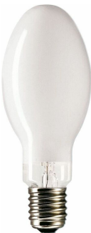
LPPR CDO-ET E40