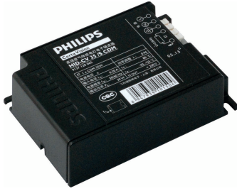
GPPR HID-CV1 0002