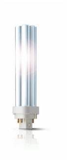
26 W 4 Pin Non integrated compact fluorescent - RFT