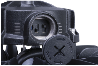
BY240P G2 Selector