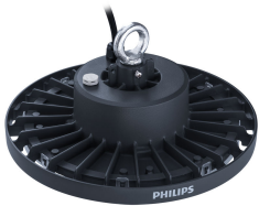
SmartBright Highbay G4