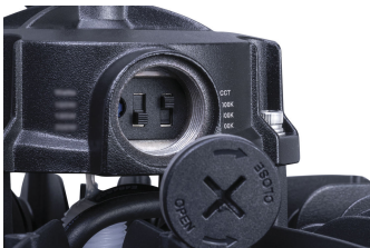
Ledinaire BY030P CCT swtch DDP3