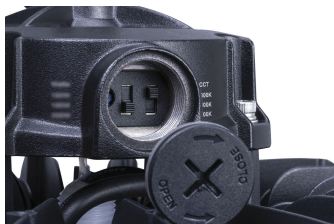
Ledinaire BY030P CCT swtch DDP3