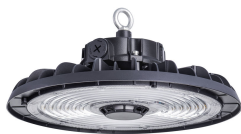
Ledinaire Highbay All-in BY30P