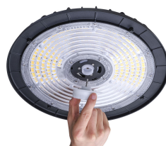
Ledinaire BY030P sensor install DPP