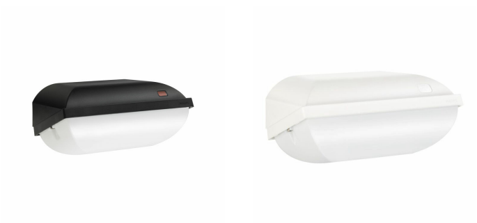
OPPR BWC110i 0007