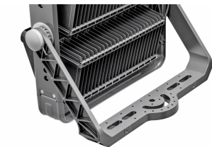
ArenaX sports area