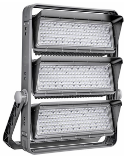
ArenaX sports area