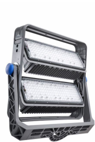
ArenaX sports area