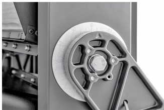
ArenaX sports area