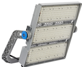
ArenaVision LED gen3 5