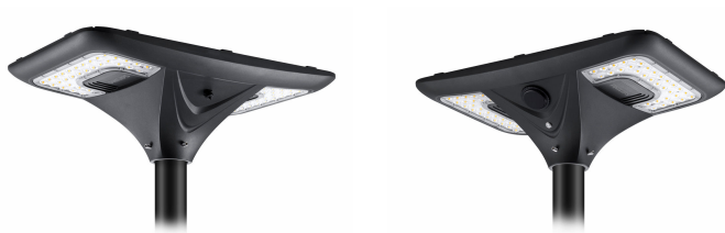
Solar All-in-one Post top