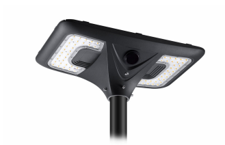
Solar All-in-one Post top