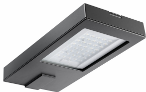
UrbanFlex small BVP730 with Accent bracket