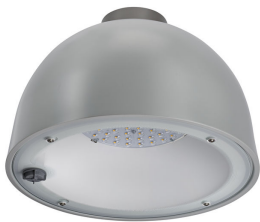
Copenhagen City Comfort large with suspended fixation