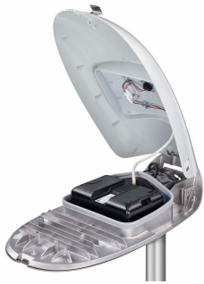
BGP502 Iridium gen4 Medium Open2