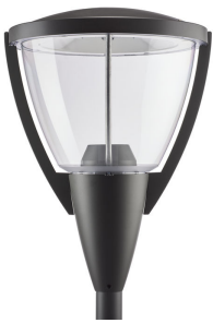
Metronomis 1 LED Berlin