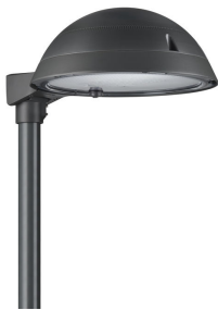
TownTune ASY DTD BDP268