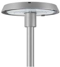
BDP260, TownTune Central Post- Top Ral 7035