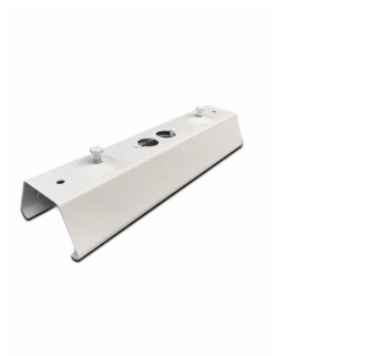
9MX056 CP WH