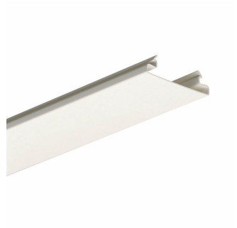
9MX056 BC49 SI