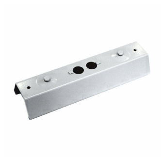
9MX056 CP SI