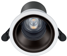
RS350 G2 RC Rd D75 1H GC