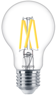
LEDclassic 40W A60 E27 CL WGD90 SRT4 1