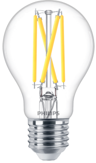
LEDclassic 60W A60 E27 CL WGD90 SRT4 1