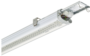
Pacific LED gen5 with push in 7-pole (PI7) connector