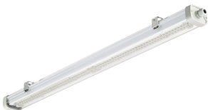
Pacific LED gen5, L1200