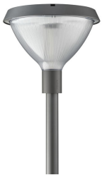
TownTune CCB plus, BDP275