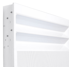
WingLine Troffer RC480