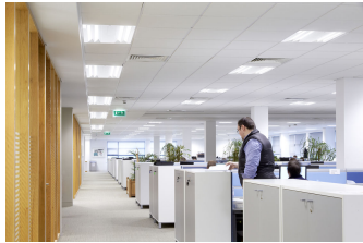
WingLine Troffer RC480