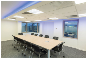
WingLine Troffer RC480