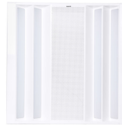
WingLine Troffer RC480