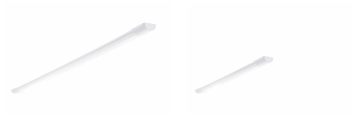
BN005 L1200 STD