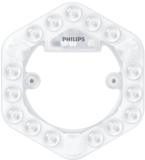
LEDtube MOD GMGC 10W Circular