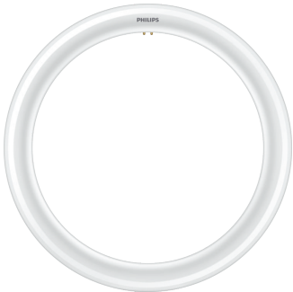
LED Circular 840 G10q AP