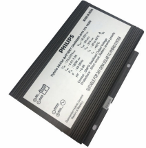
ComboCC Gen 4.0 Hybrid Supply Unit