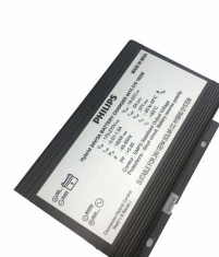
ComboCC Gen 4.0 Hybrid Supply Unit