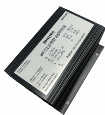
ComboCC Gen 4.0