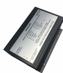
ComboCC Gen 4.0 Hybrid Supply Unit