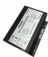
ComboCC Gen 4.0