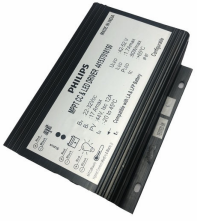
ComboCC Gen 4.0