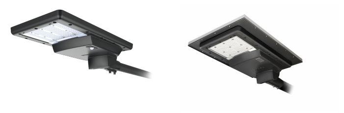
standard shot sunstay