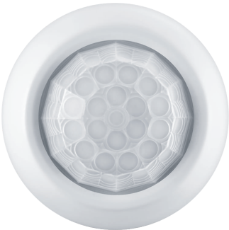
LEDTForce HB Accessory