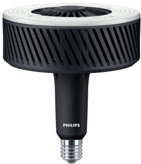
LEDTForce HPI Others E40