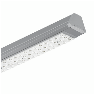
Maxos LED Industry