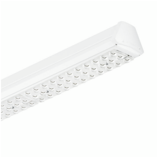
IPPR 4MX850i 0003