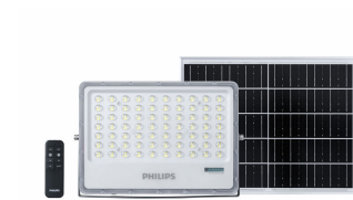
Essential SmartBright LED Solar Flood BVC010