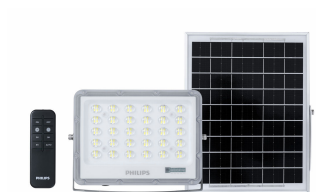
Essential SmartBright LED Solar Flood BVC010