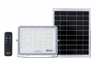
Essential SmartBright LED Solar Flood BVC010