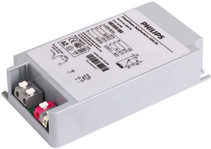
Lamp Driver, eHID, HID-PV Base 50 SON C3 220-240V