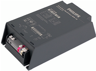
GPPR IPVCP0Xt 0016