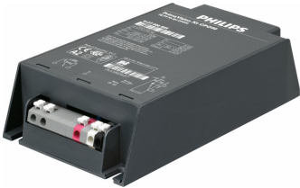
GPPR_IPVCP0Xt_PHL_0011- Product photo