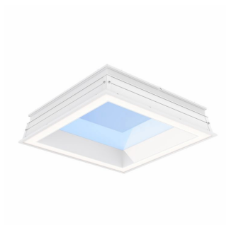
LP913P NC3 SKYLIGHT W60L60