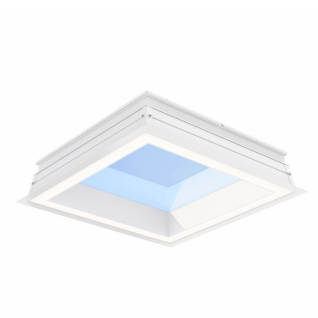
LP913P NC3 SKYLIGHT W62L62