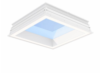
LP913P NC3 SKYLIGHT W60L60