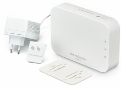
LP912P NC2 CONTENT GENERATOR - LINK