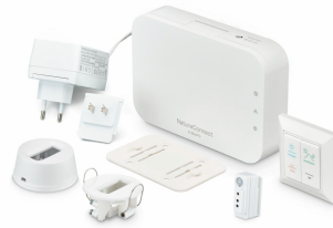
NCT IMG Scene Set