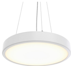
Essential Suspended RTP