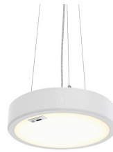
Essential Suspended RTP