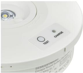
EM152C Emergency recessed Downlight details