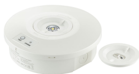
EM152C Emergency Recessed Downlight family