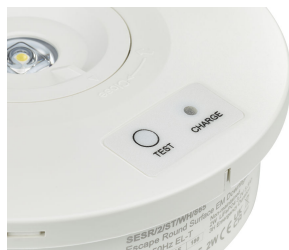
EM152C Emergency recessed Downlight details