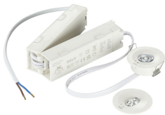
EM150B Emergency spot