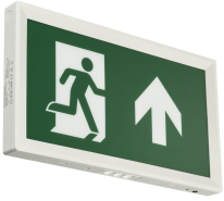
Emergency Slim Exit Sign EM155C SPP