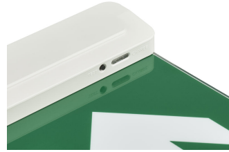
Emergency Exit Sign EM159C DET01