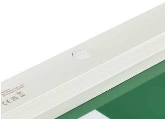
Emergency Exit Sign EM159C DET02