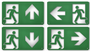
Emergency Exit Sign all legends