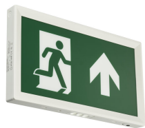
Emergency Slim Exit Sign EM155C SPP