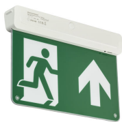
Emergency Exit Sign EM159C SPP01