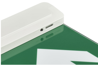
Emergency Exit Sign EM159C DET01