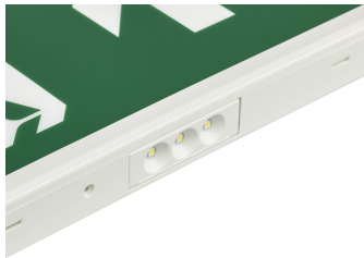
Emergency Slim Exit Sign EM155C DET01