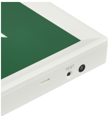
Emergency Slim Exit Sign EM155C DET02