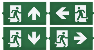
Emergency Slim Exit Sign all legends