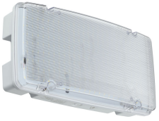
Emergency Bulkhead_EM154C SPP