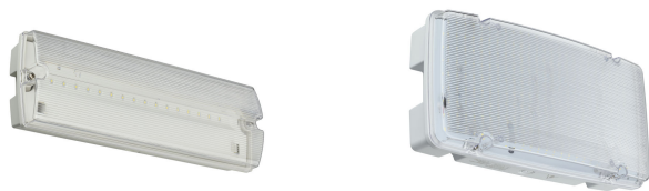
Emergency Bulkhead_EM153C SPP02