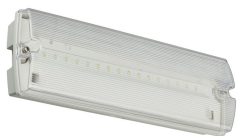
Emergency Bulkhead_EM153C SPP02