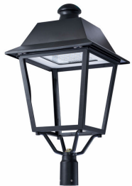
UNI POSTTOP CLASSIC